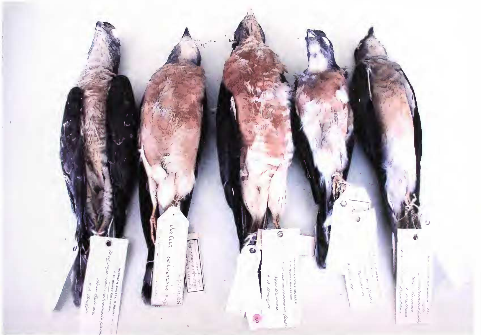
Plate 1. The five Chinese Sparrowhawks collected in New Guinea in the nineteenth century at unspecified localities, held at the Natural History Museum, Tring, UK. From left to right: NHMUK 1955.6.N.20.2635; 1873.5.12.1638; 1955.6.N.20.2636; 1955.6.N.20.2633 and 1955.6.N.20.2632.